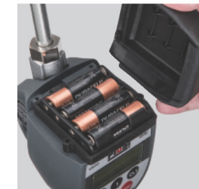
Sealed battery box