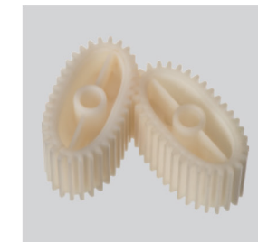
Uses oval gears